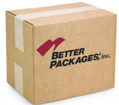
Carton sealed with Better Pack Tape and the BP 333 Plus

*Based on the average 3-month life expectancy of a handheld plastic tape gun, one carton sealing professional will use and discard approximately 64, non-recyclable tape guns. Better Pack dispensers have an expected lifespan of 16 to 20 years.