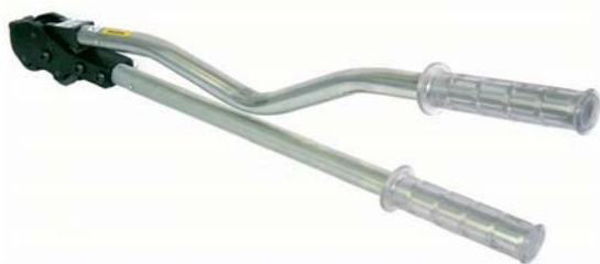
CHART OF TYPES