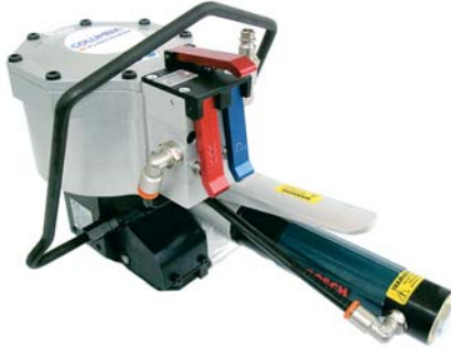
CHART OF TYPES

FLAT SURFACES PNEUMATIC SEALLESS STRAPPING TOOL FOR STEEL STRAP