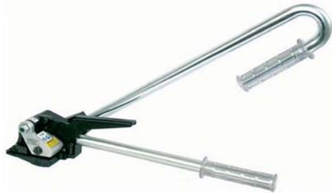
CHART OF TYPES