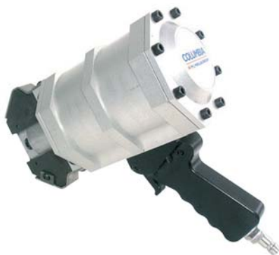
CHART OF TYPES