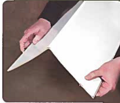
Mega VBoard is available in sizes up to 9' x 9' (18" of total paper; 2" leg minimum).