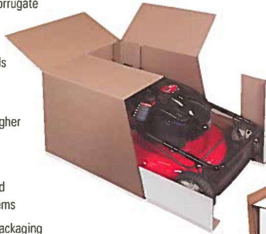
Add strength where it's needed to fortify packaging and deliver savings.